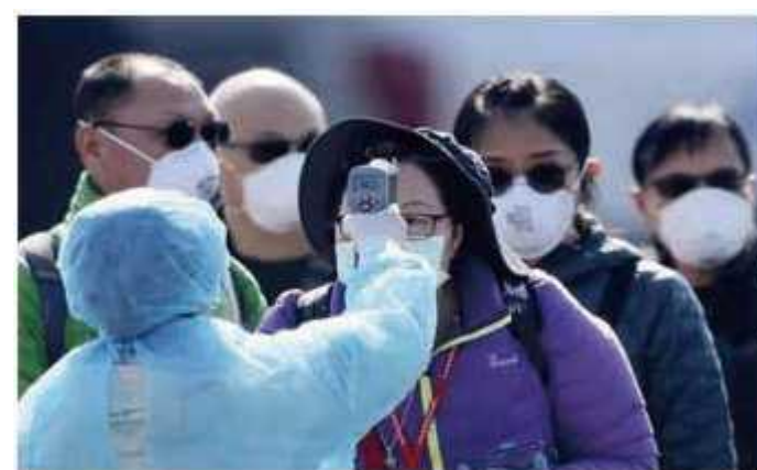
High Volume of Management